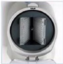
Before & after centrifugation (angled position)