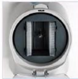
During centrifugation (Horizontal position)