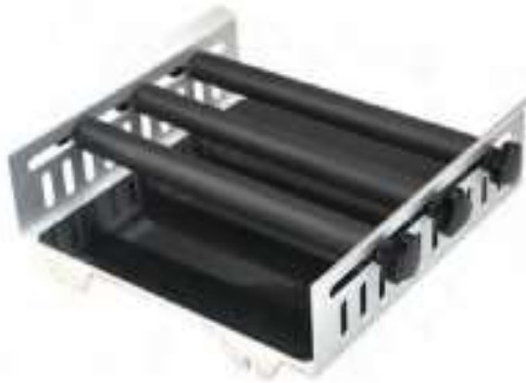
Universal attachment with bars