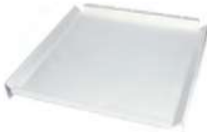
Dish attachment with non-slip mat