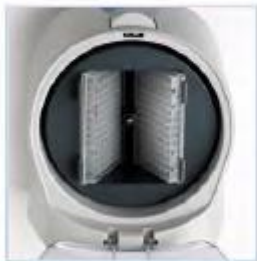
Before & after centrifugation (angled position)