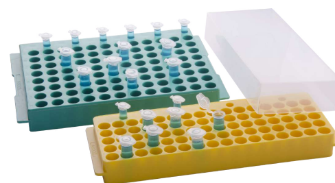
Reversible Rack with Cover