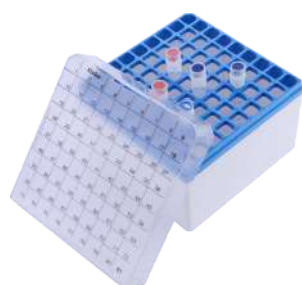
Cryo Box, PC