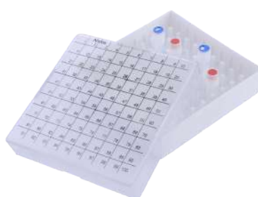
Cryo Box System - 100, PC