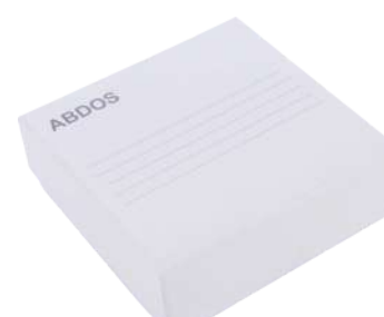
Freezing Cardboard Cryo Boxes