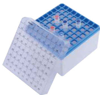
Cryo Box, PC