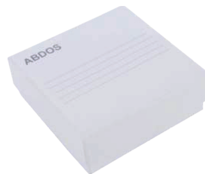
Freezing Cardboard Cryo Boxes

CAUTION: Cryovials are recommended to use in vapour phase of liquid nitrogen.