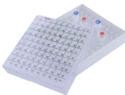
Cryo Box System - 100, PC