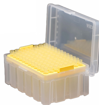
Last Drop Low Retention Pipette Tips, Sterile Racked