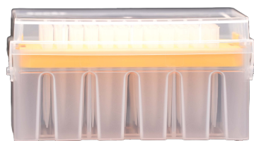
Last Drop Low Retention Pipette Tips, Racked