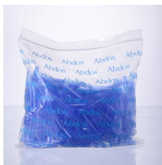
Last Drop Low Retention Pipette Tips, Bulk in Resealable Bags