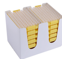
Last Drop Low Retention Pipette Tips, Refill Pack